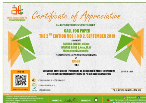
Picture 3.Display e-certificate in APTISI Transactions on Technopreneurship (ATT Journal)

The picture above is an e-certificate display on the ATT Journal accompanied by an encryption code that was used at the time of publication.