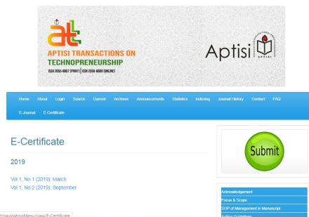
Picture 2. E-certificate menu in APTISI Transactions on Technopreneurship (ATT Journal)