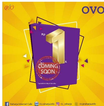
Figure 3. Rp.1K Coming Soon OVO Promo

communication media used as promotional media that will be applied to Raharja Internet Cafe (RIC). and will publish the results of poster designs on social media.