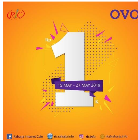
Figure 6. OVO Promo Rp. 1K