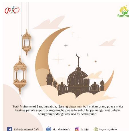
Figure 4 Ramadhan

Figure 3 is a poster design of OVO 1k promo information which will be at Raharja Internet Cafe (RIC), for the poster size of 640px X 640px which will be posted on RIC social media.