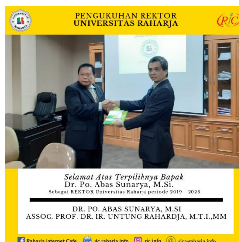
Figure 5. Inauguration of Raharja University Chancellor

Figure 4 is a poster design that is a medium to welcome the coming of the holy month of Ramadhan, and congratulation fasting to the whole community especially private Raharja, for the poster size is 640px X 640px which will be posted on social RIC Media.