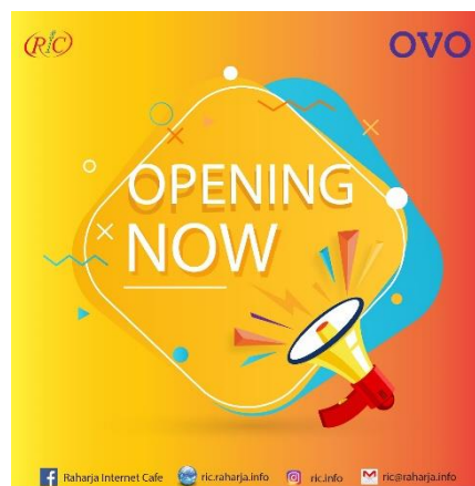
Figure 7. RIC collaboration with OVO

Figure 6 is a promotional media such as certain events that took place at Raharja Internet Cafe (RIC) and in the poster gives the event period to be held, namely OVO Promo Rp. 1K.