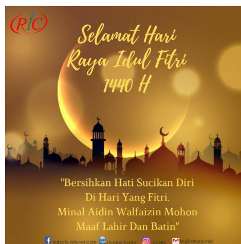
Figure 11. Eid al-Fitri

Figure 10 This poster design is a medium used to welcome the birthday of Pancasila which falls on June 1.