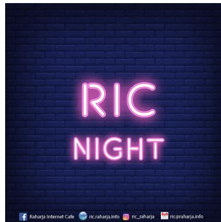
Figure 9. RIC Night

Figure 8 is a poster design which is a medium to congratulate all Buddhists who celebrate Vesak Day.