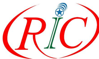
Figure 1. Logo Raharja Internet Cafe

important things in the social life of the younger generation. This can be well utilized by business people in conducting promotions.