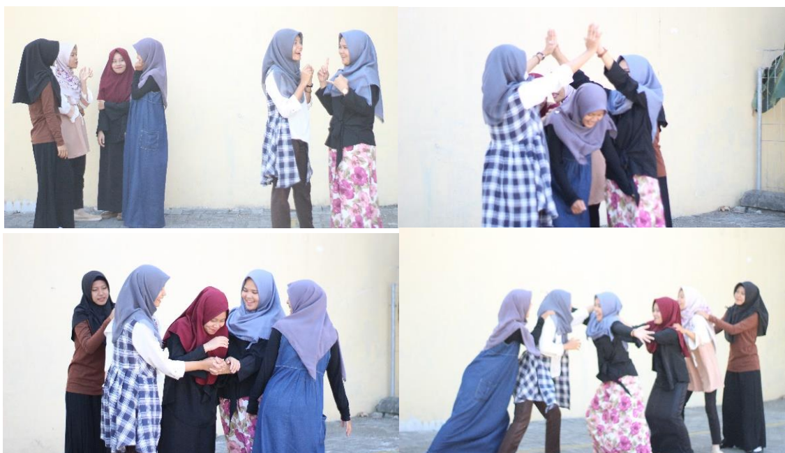
Picture 1. Playing Ular Naga Games