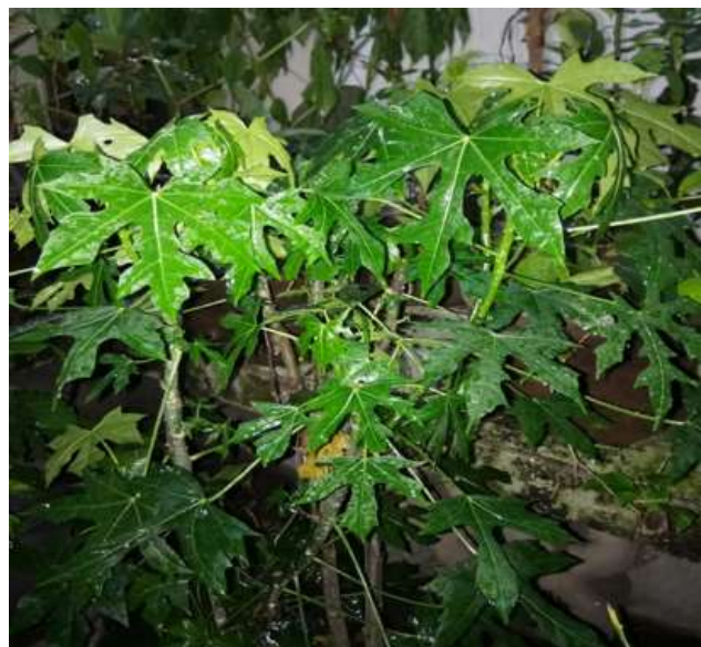
Figure 1. C. chayamansa tree has palmately leaves with deep lobate notch

and cinnamic acid derivatives (de Oliveira-Júnior et al., 2018), isoquercetin, campesterol, eupafolin, and hispidulin (Sanchez-Hernandez, Barragan-alvarez, Torres-, & Padilla-camberos, 2017). The administration of C. chayamansa alcoholic leaves extract showed significantly different results in parameters profile among groups (Table 1).