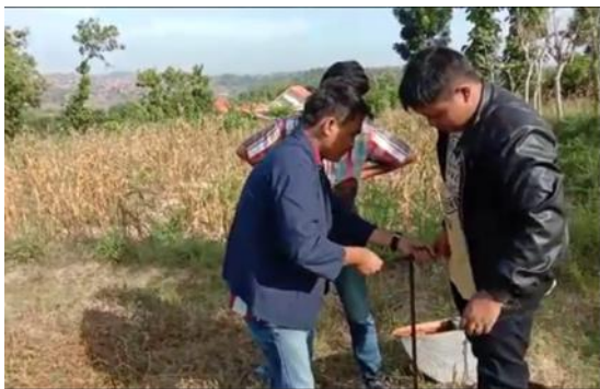
Figure 5. Installation of water containment pipes in the field

The pipe size of 89 millimeters is installed with a minimum depth of 1 meter, but at the KKN-PPM Team location, the drilling could not reach the target depth due to the ground on this rock (Figure 5).