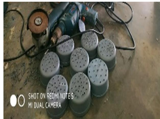
Figure 4. The Process of Making Pipe Covers for Water Infiltration

From the results of the study Victorianto, Qomariyah, & Sobriyah, 2014 it was found that the biopore hole was used to absorb rainwater and store it in the soil so that it could overcome the dry soil conditions during the dry season. Therefore the KKN-PPM team makes water containment (boipore hole) in Blaban village to overcome the drought.