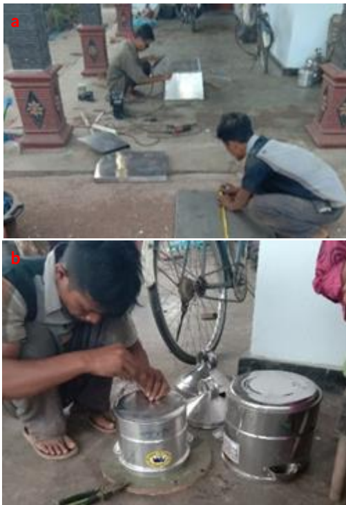
Figure 7. Manufacturing of purple uwi chips production machines. (a) vacuum frying machine, (b) spinner.

machine, spinner, sealer. The KKN-PPM team made a cutting machine using wood and stainless steel plates (Figure 6).