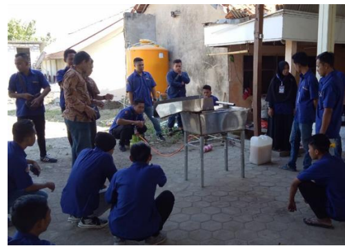
Figure 8. Socialization of vacuum frying machines

Secondly, to socialize the food drying oven by using tools from the KKN-PPM team, Blaban Village people are very enthusiastic to participate in the training program to dry the food of purple uwi chips (Figure 8). Thirdly socializing the vacuum frying machine by using tools from the KKN-PPM team, Blaban villagers are very enthusiastic in participating in the training activities of cooking purple uwi chips.