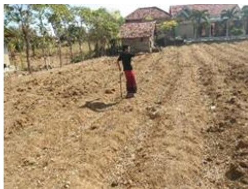
Figure 1. Condition of soil structure in Blaban Village

Satya Lencana Wirakaya Agriculture in 2011. The most important agricultural commodities in Pamekasan Regency include food crops and horticulture.