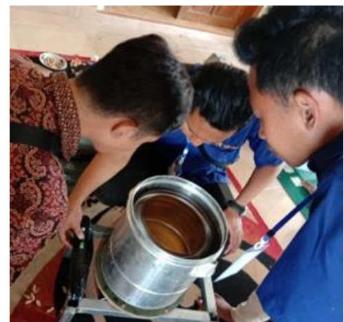
Figure 9. Socialization of The Spinner Machine

Fourth, socializing the Spinner machine by using tools from the KKN-PPM team (Figure 9), Blaban villagers were very enthusiastic in following the purple uwi chips drainage training activity using this spinner machine.