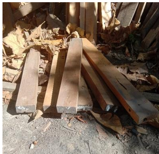
Figure 6. Making a purple uwi chips cutting tool

Blaban villagers are rich in these plants, but Blaban villagers sell these purple uwi plants very cheaply, which is around 5,000 rupiah per kilogram, therefore the KKN-PPM team utilizes these purple uwi plants to make purple uwi chips. With innovation into purple uwi chips, purple uwi plant sales increased 60 percent from the beginning. So Blaban village people try to increase these sales by using production equipment so that the sale of purple uwi chips is increasing. Also, other regions rarely process purple uwi into chips, especially purple uwi chips. This could have the opportunity for Blaban Village to become a pioneer for processing purple uwi chips.