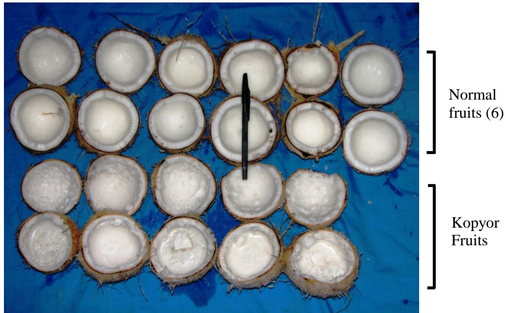
Figure 2. Segregation of normal and Kopyor coconut fruits harvested from a single coconut bunch. The total number of harvested fruit was 11, the normal fruits were 6 (above), and the Kopyor fruits were 5 (below), respectively