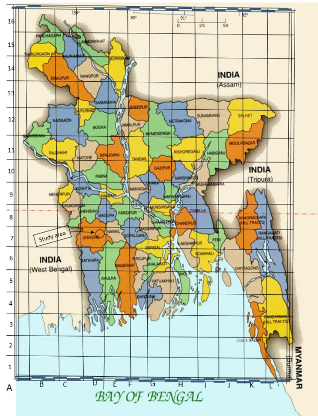
Figure 1. Map of Bangladesh showing location and site of the study of mite management

A three year study was carried in an area of about 696 ha in Bagharpara sub-district under the district of Jashore (Longitude, 89°06' - 89° 28' and Latitude, 23° 04' - 23° 20') comprising six consecutive villages. The location of the study was 12 km towards East of the Regional Agricultural Research Station (RARS), a southwestern research station of BARI (Figure 1). A pre-prospecting survey was conducted for demarcating the study area and counting the number of palms in the area. A local land-map was used to estimate the area comprising in the study site. Randomized Complete Block Design (RCBD) was adopted and the whole area was divided into three sub-locations as Bloc I, Block II and Block III where treatments were replicated thrice. There were six treatments and each treatment included five (5) palms. Altogether there were 90 (6 x 5 x 3) palms in the