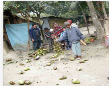
Plate 12. Infested nuts are cleaning before spraying miticide

The mite was microscopic, slender, vermiform and whitish in color (Plate 6). Eggs were shiny white and globular in shape (Plate 4 & 6). Cardona and Potes (1971), Julia and Mariau (1979) and Hall et al. , (1980) similarly described and documented mite and infested nut.