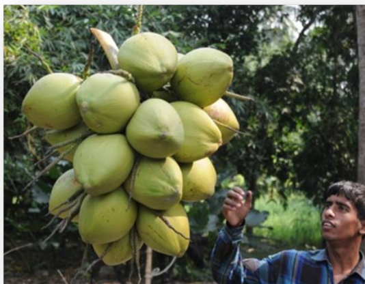
Plate 7. Harvesting damage free healthy coconut from a treated palm