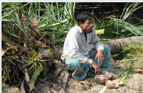
Plate 11. Coconut at the extinction due to mite