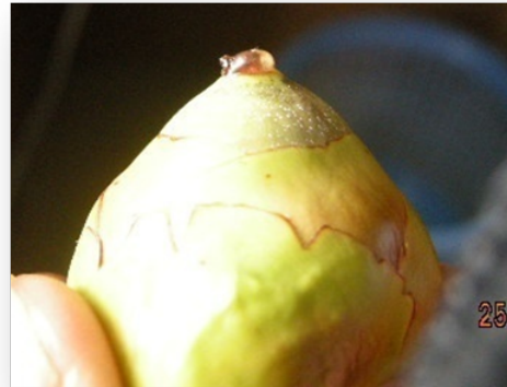
Plate 10. Receptive female flower