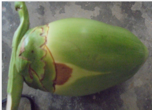
Plate 5. Triangular yellowish brown patches extending distally on the fruit surface