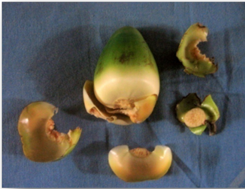
Plate 9. Female flower after fertilization