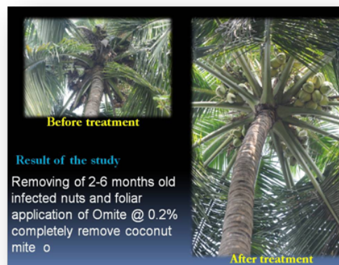
Plate 8. Mite infested palm (a) before treatment (b) after treatment