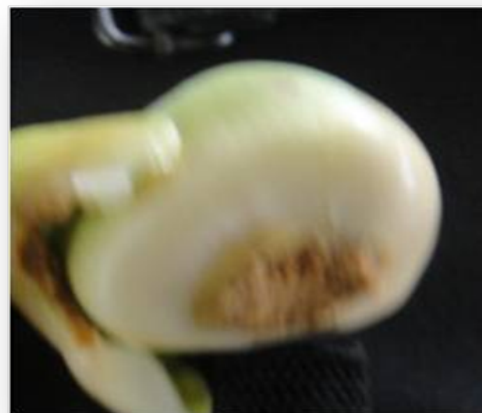
Plate 2. Unfertilized button nut without any sign of mite attack