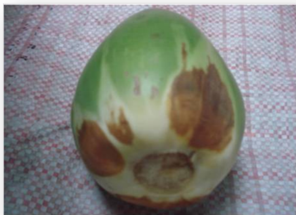
Plate 1. Mite infested tender nut of age about 3 month