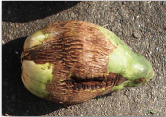
Plate 3. Mite infested nut of age about 7 months