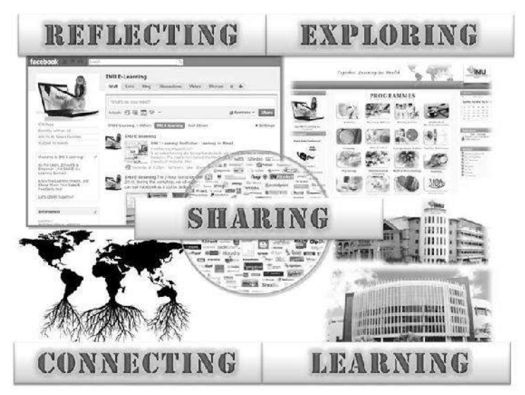
Figure 1. Sharing Material

When we used to hear the term e-learning refers to the learning method that utilizes distant history of internet technology, both based CMS or LMS. Today, the term E-Learning slightly shifted to F-Learning or Learning Facebook or Facebook-based learning.