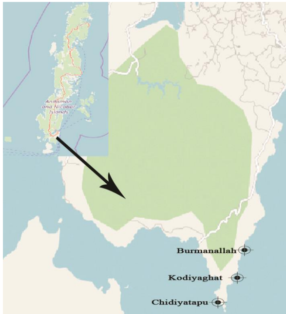
Figure 1. Map showing the three Study sites

ter of Andaman Island, especially from a typical tropical marine habitat of Indian EEZ leads to the present study.