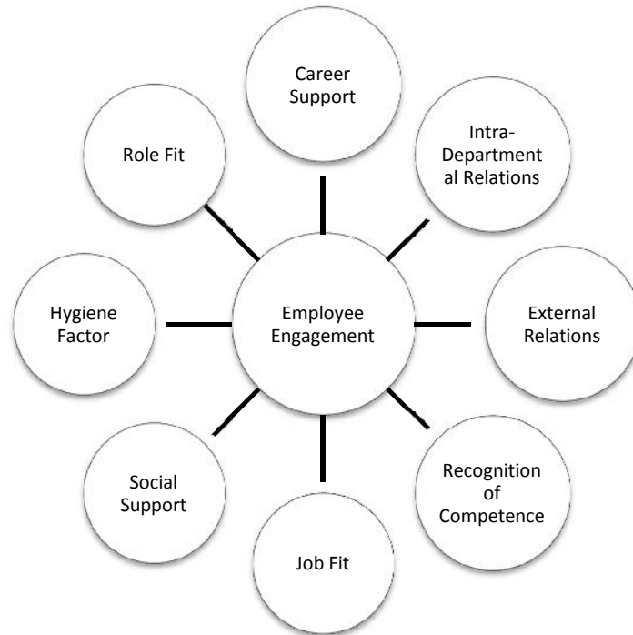
Figure 1 – Factor Affecting Employee Engagement

employees to do more efficient and effective work on their job. The last one is hygiene factor, which means the resources given from the company to the employees, resources either for the work they were doing and also resources for the compensation the company given to their employees.