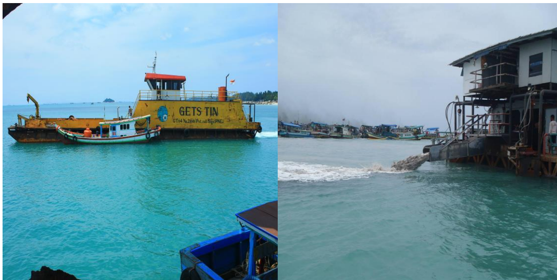
One of tin mining on the beach