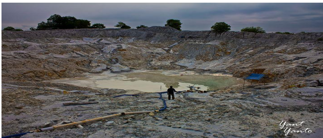
Ext. tin mining area.