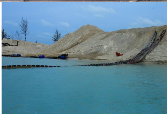
A grandmother lives alone in this house & Tin Mining Area in a big scale.