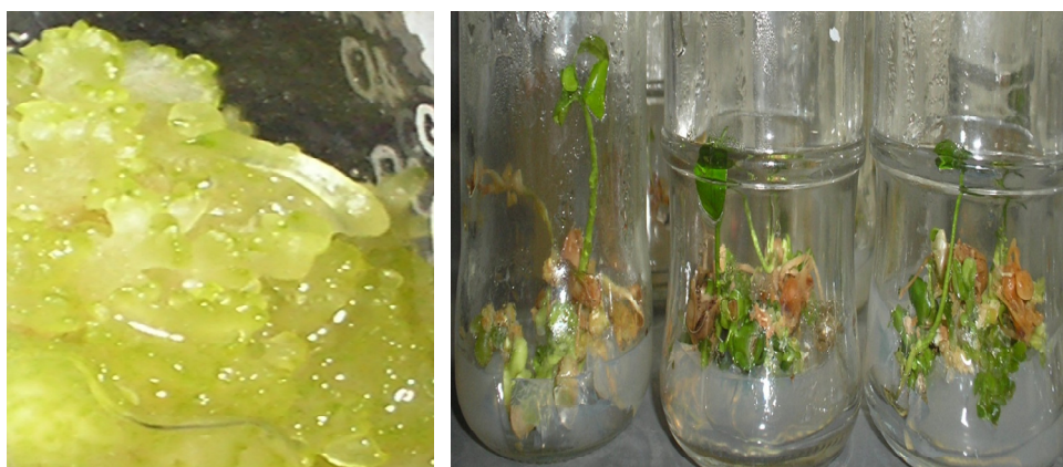
Figure 3. The growth and development of plantlets of local citrus in culture medium enriched with growth stimulator: (a) The plantlet emerged from calli (b) Plenty of plantlet in various sizes.

D 0 = 2,4-D 0.0 mg/l; D 1 = 2,4-D 0.5 mg/l; D 2 = 2,4-D 1.0 mg/l; B 0 = BAP 0.0 mg/l; B 1 = BAP 0.5 mg/l; B 2 = BAP 1.0 mg/l; B 3 = BAP 3.0 mg/l.