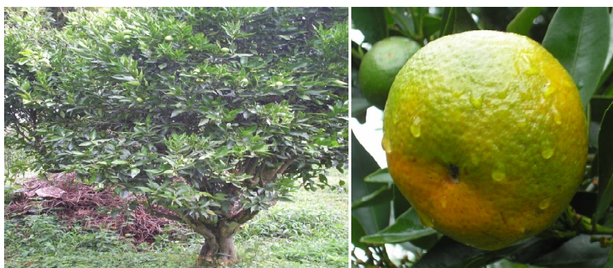
Figure 2. The plant appearance of Citrus nobilis Var. Brastepu and it's fruit

variation of the growth stimulator in MS solid media enriched with 2,4-D: 0; 0.5; and 1.0 mg/l and BAP; 0; 0.5; 1.0, and 1.50 mg/l results in the variation of the culture (Figure 3b). Low intensity of callus is observed when using growth stimulator 2,4-D 0 mg/L and BAP 0.5 mg/L ( D_0B_1 ), where when the culture is enriched with 2,4-D 1.0 mg/L without BAP ( D_2B_0 ) produce high intensity of callus. Callus induction in D_2B_0 is found very good, however it does not produce shoot. The MS medium consisted of 2,4-D 0.5 mg/L without BAP ( D_1B_0 ) could initiate the callus in medium intensity and could directly produce shoot. Therefore, the medium culture that is enriched with 2,4-D 0 mg/L and BAP 0.5 mg/L ( D_0B_1 ) is found effective to initiate the shoot in the shoot tip culture of Citrus Brastepu .