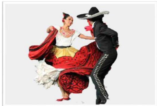
Image 1. Chamarreo Dance

the muscles to have strength and flexibility and follow the aesthetics of the body.