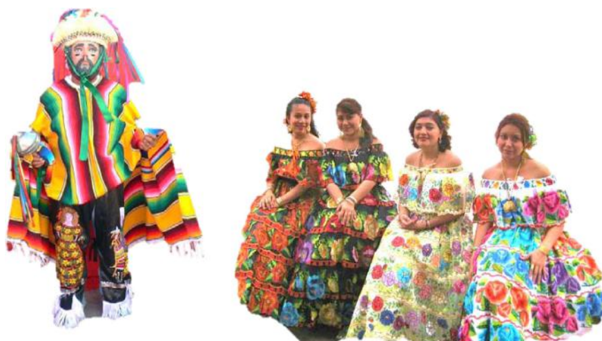
Image 8. Parachicos and Chiapacorceanas

This article explains about the Parachicos dance in order to understand Chamarreo . The Parachicos dance comes from an ethnic group named Chamulas , which means red head bird. This group of indigene people is divided in two groups: tzoltziles and tzeltales . The symbol of the dance is usually represented by a snake and a tiger. The dance is accompanied with music made by harmonica, guitar, and violin. It can also be played with marimba , which is like a traditional gamelan or similar to it because both are about percussions.