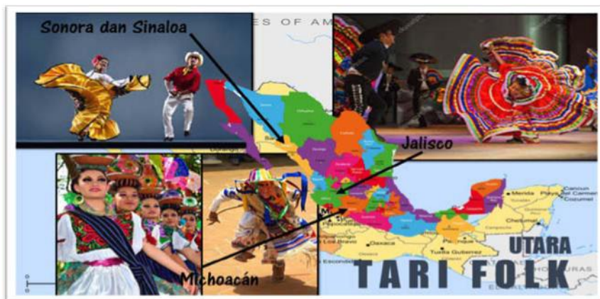
Image 6. Some central, northern dances, between the big repertoires of Mexico

The deer dance “Danza del Venado” is performed in Sonora and Sinaloa located in the north of Mexico and also in the very far south of Arizona, now United States of America. The