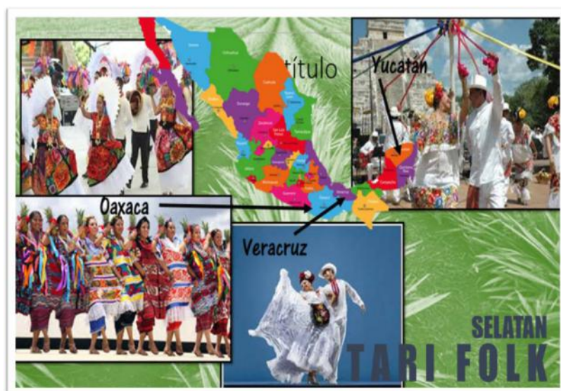
Image 7. Southern Mexico

Every year, thousands of dancers and locals gather together to represent their state through different performances. The festival offers visitors the experience of concerts, parades, and gastronomic fairs that showcase Oaxacan legacy. But the main attractions are the dances. As a way to reinforce the meaning of Guelaguetza , dancers also throw presents chocolate, fruit, food, and other traditional products to the audience, in order to preserve the culture.