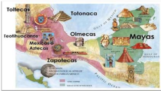
Image 5. Tribes of Mexico

The third kind of dance that we are talking about in this work is the indigenous/native traditional dance. This dance comes from the different tribes of different cities in Mexico. This dance also finds itself in rituals.