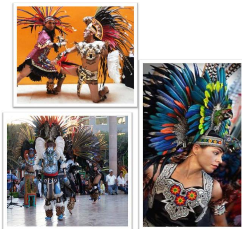
Images 4. El Son de la Negra from Jalisco

The Ritual dance was discovered mostly in the south of Mexico with the “Mayas” tribe, between other tribes. In the picture below you can see a part of the south of Mexico. The names that are written in the picture are the different tribes of that area.