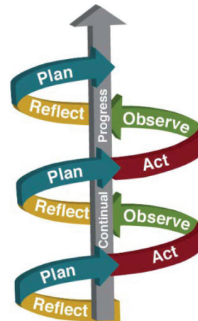
Figure 1. The Action Research Spiral

observation and reflection. This classroom action research is designed in Kemmis & McTaggart's model which involved a set of steps in repeated cycles as set out in the figure below: