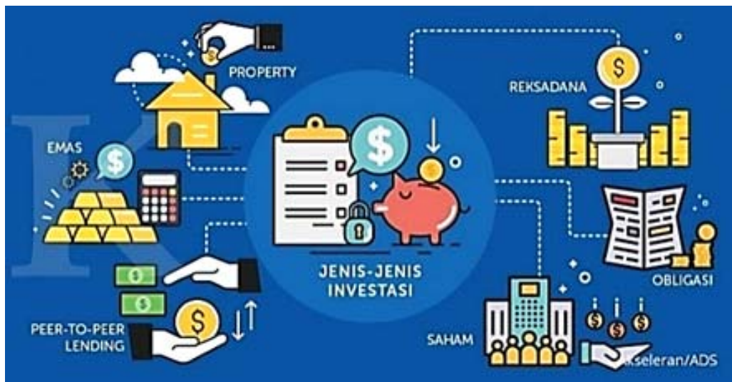
Figure 1.1 The Various Types of Investments

In addition to the level of consumption, another thing to consider is related to community decisions regarding saving, insurance, and investment because every activity aggregately related to household financial management will have an impact on a country's economic performance. The allocation of public income to invest is very important because investing can allocate fund or capital to obtain expected goals in the form of future profit and these investments made by the community will encourage the progress of a country.