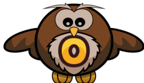
Figure 3. Texture Design of target atom

Atomic targets are actors who are targeted by ammunition atoms fired by players. If the player shoots the right ammo atom in the direction of the target atom, the bond and score increase. However, if the player fires ammunition atoms that are not right at the target, the lives of the players will be reduced.