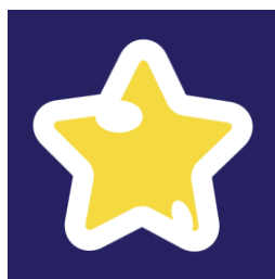
Figure 4. texture design of star

Characters in the game that when shot using ammunition atoms will increase the number of stars from the player. This total star can later be used to buy or upgrade items in the game so that the game becomes more fun to play.