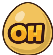
Figure 2. Texture design of ammunition actor

and strength of the shot so that it hits the target correctly. Ammo atoms have different atomic codes depending on the level being played.