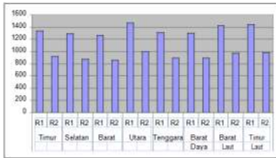
Table 3.1 Illumination in Inner Space Workplan without Shading Device on March 21 at 12.00 (lux)