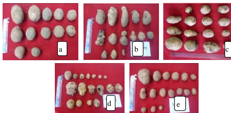
Fig. 3. Potato Granola potato tube on Land B

The result of serology test by DAS-ELISA was showed that some positive plants were infected with PVX, PVS, PVY, and PLRV. Based on the percentage of disease incidence in 27 samples of Granola potato crops varieties in Pancasari Village, Bali was predominantly infected with Potato Virus Y and Potato Virus S (Table 4).