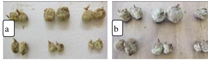
Fig. 4. Thermotherapy results of the potato tuber of the first land.

a. before thermotherapy (tubers and healthy shoots), b. after thermotherapy (some rotten tubers, some shoots withered and dried)