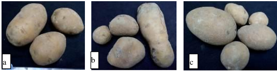
Fig. 2. Potato tuber of Granola varieties on land A.