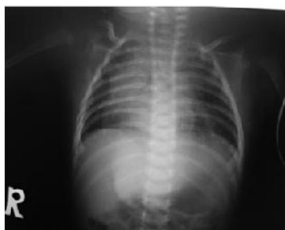
Figure 2. Chest - ray showed complete absence of sternum, normal pulmonary vascular markings and a midline chest deformity, cardiothoracic ratio 56%.

(Figure 2). A two dimensional echocardiography showed atrial situs solitus, a primum large atrial septal defect (ASD), large inlet to outlet ventricular septal defect (VSD) (8.3 mm), common arteriovalvular (AV) valve. The conclusion of echocardiography was complete atrioventricular septal defect (AVSD), which was known as a group of cyanotic congenital heart defect (CHD) (Figure 3).