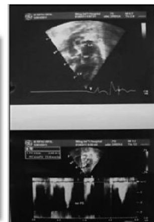
Figure 3. A two dimensional echocardiography showed complete atrioventricular septal defect. (AVSD).