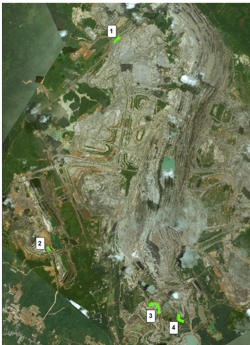
Figure 1 Four sampling locations.