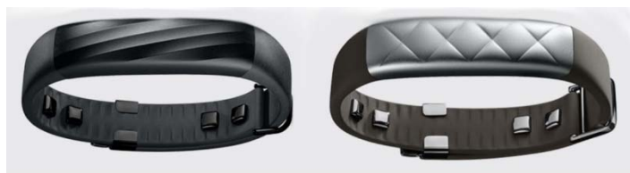
Figure 2. Jawbone UP3

(adapted from: http://www.ebay.it/itm/Jawbone-UP3-Stylish-Fitness-Tracker-Bluetooth-Sync-Health-Sleep-Activity-/171845748006 )