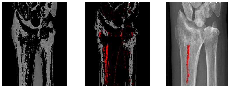
Figure 3. Fracture area extraction after k-means, (a) After K-means, (b) Candidate fracture, (c) Fracture area