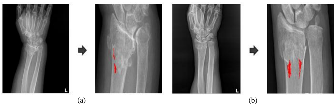
Figure 4. Fracture area extraction success and failed cases, (a) Successful extraction (b) Failed extraction

The proposed method is implemented in C# under Visual Studio 2017 environment with Intel(R) Dual Core(TM) i3-5005U CPU @ 2.0 GHz and 4 GB RAM PC. Twenty (20) X-Ray images containing hand bone skeleton with fracture in some place of 1208 x 1502 size were used in this experiment. In experiment, our cooperated pathologist evaluate if the result come out of the software is sufficiently meaningful. The pathologist agrees with the proposed method's results in 16 out of 20 cases. Figure 4 demonstrates both the successful extraction case (Figure 4(a)) and failed extraction (Figure 4(b)).