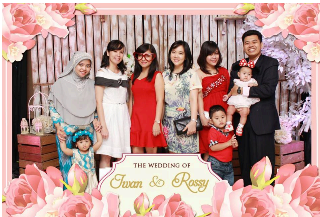
Figure 01. An example of a photo corner

The Creative Industries potential has grown along with the development of Visual Communication Design science as well as the technology development. Photo corner service is one type of business that was born from the Visual Communication Design and technology development. The definition of photo corner / photobooth is photography service using a background to an event, where the event can be birthdays, weddings, or product launching event, and other events, which usually allocated as souvenirs for the guests and the event organizer to do photos, Martua Sianipar (2012).