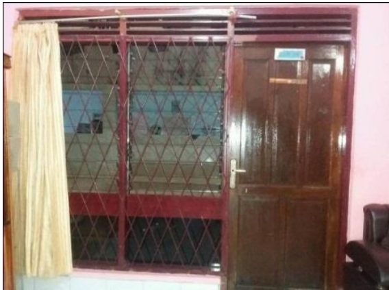
Figure 6. The Connecting Door and Window

Figure 6) that connect between living room and semi-private rooms in the asrama .