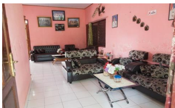
Figure 5. Living Room

All occupants agreed upon the limited access for male guests in the asrama . This is because they need their own privacy even when they are in the public spaces, such as living room. Almost every day during my fieldwork in the asrama , there were male guests who visit the asrama . When male guests visit the asrama , the occupants have to dress decently. They are not allowed to wear short pants, tight and sleeveless clothes. Orchid (21 years)—a senior—said that “when a male is not around, we can freely wear anything we want in the asrama , except in the living room, the public space”. She, for example, sometimes wear a tanktop. When a male visits, every body escapes from the living room. In addition, Mawar (24 years), an alumni, explained that she and other occupants usually wear sexy clothes in the asrama . Therefore, it is better for male guests to be just up to the living room because when male guests visit, this will intervene their freedom (see the living room in Figure 5).