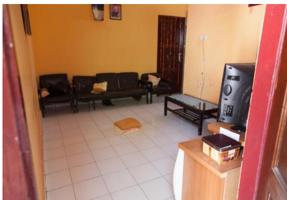
Figure 3. TV Room

Semi-private spaces are the spaces where male guests can only get in if there is an urgent need, preceded by saying “ tabe ”, such as when a male guest is intended to use the toilet, or to pass the kitchen. When a male guest intends to eat in the dining room (see Figure 4 below) invited by the occupants, he has to ask permission from a pengurus asrama before saying tabe . But, he has to leave as soon as it is done. Mawar (22 years)—an alumni—commented on this by saying that it is better for male guests to just be in the living room. It is easier for him because he does not have to say tabe anytime he enters semi-private rooms (Mawar, 20 September 2016), and, of course, it is also easier for the occupants of the asrama . Another Semi-private space is hall room, which is commonly used to gather all members of AMKT Mulawarman (both male and female) when they have a regional meeting or party.