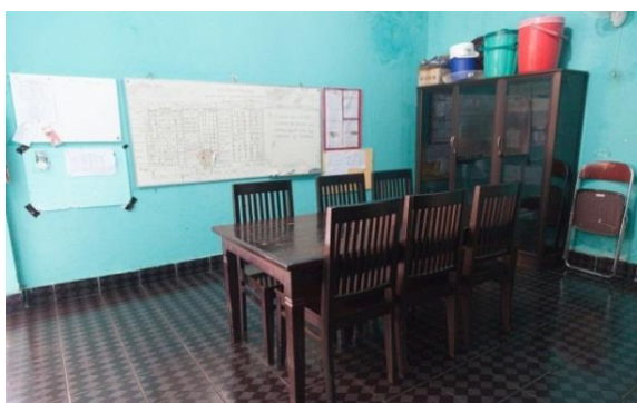
Figure 4. Dining Room