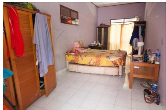
Figure 2. Bedroom

guest". Private spaces are also spaces where occupants feel free and comfortable to wear any kind of dress without feeling shame and fear of being seen by the opposite sex. Other than these spaces, they should fully dress in case there is a male guest who passes public and semi-private spaces.