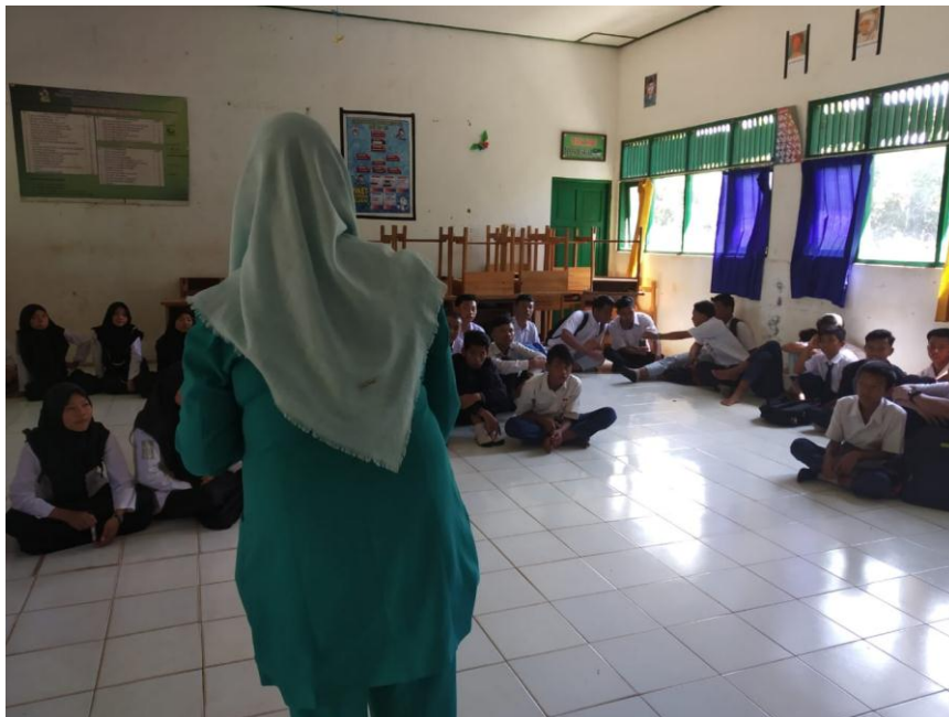
Picture 1 Lecture Session

The training was conducted for one day, on July 2019. The authors acted as the trainers with some helps from the English Department Students, Teacher Training and Education Faculty, University of Muhammadiyah Banjarmasin. The first session was a lecture. It focused on sharing some tips of what the students should and should not do during a job interview. The trainers talked about what kind of attire the students should have, how to handshake and have eye-contact with the interviewer, what kind of language and body posture to use. In this section most of students showed their enthusiasm by asking some questions related to the topic.