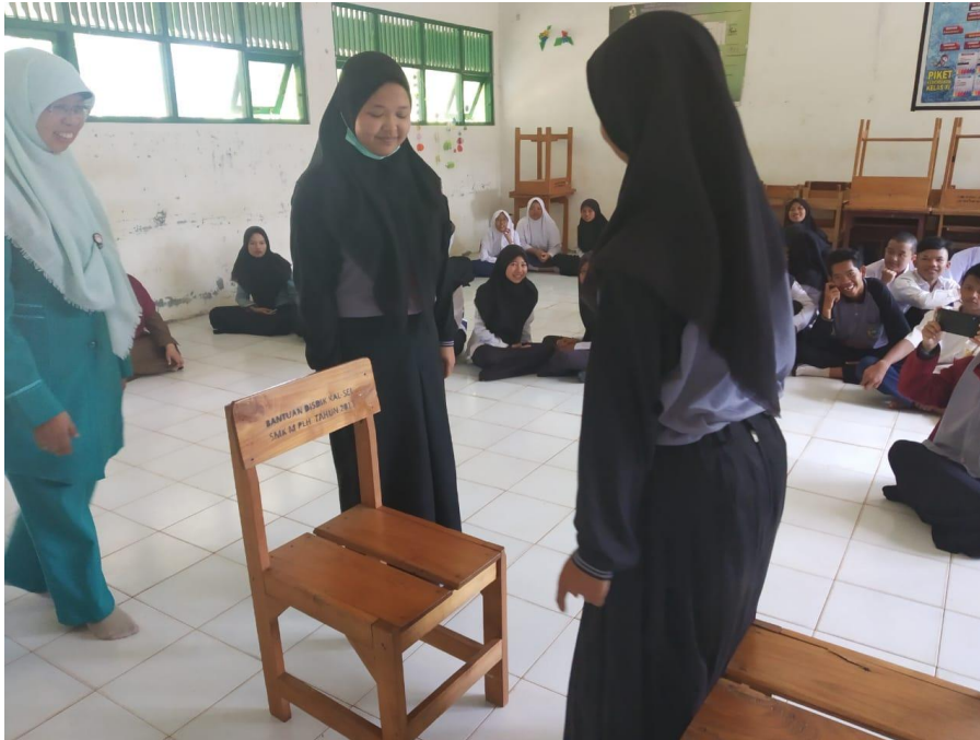
Picture 3 The Students Practicing a Job Interview