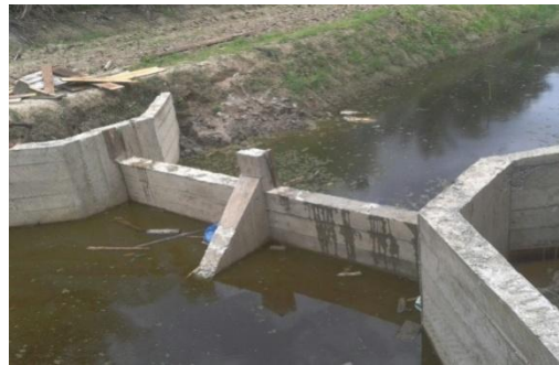
Figure 1. Canal blocking is ready to use for water