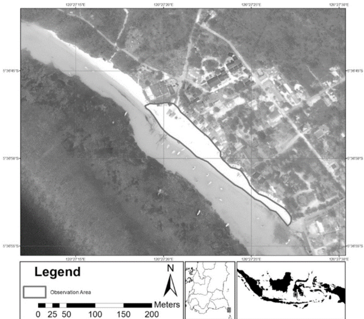
Figure 1. Map of the study area. Image from Google Earth.