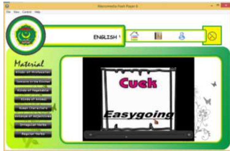
Picture 7: The layout of vocabulary related to Human Character theme