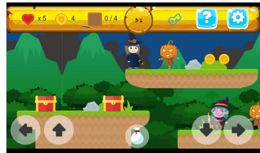
Fig. 3. Game Interface

The game interface of the mobile based educational game of basic programming subject for X grade is presented in Figure 3.