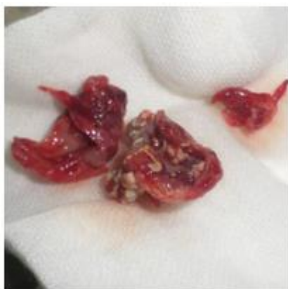
Fig. 5. Dentigerous cyst lesion.