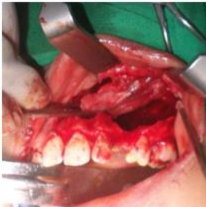
Fig. 4. Cyst space after enucleation.

The dentigerous cyst could easily be identified radiologically because of the typical radiographic view. Usually it is viewed as a simmetrical, unilocular, clear margin, and surrounding unerupted (impacted) tooth crown except for infected cysts which borders are unclear (Shear 2012, Pramono 2006). The slow and regular growth of the cyst, makes the dentigerous cyst have a distinct sclerotic border, with a clear cortex, and marked by a thin radiopaque border, especially if the cyst is relatively large in size or if there was a shift of the tooth position (Pramono 2006, Sudiono 2011).