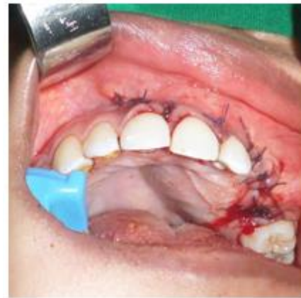
Fig. 6. Intra oral after cyst enucleation.