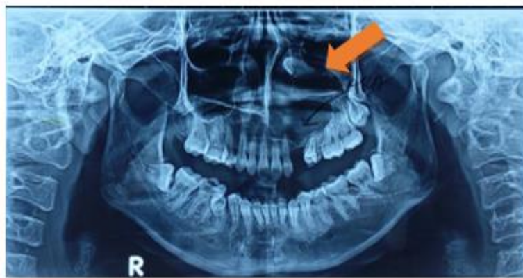
Fig. 3. Panoramic radioimaging showed a radiolucent lesion on the apex of left upper tooth with impaction of 23 at the orbital floor.

From the panoramic imaging, the lesion was radiolucent with a thin radiopaque border, the lesion expanding from 21 to 26 with expansion to the superior direction and reached the floor of the orbita; a radiopaque image from the unerupted canine at the base of the orbita shown.