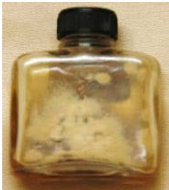
Figure 3. Macroscopic appearance of the colony of M. gypseum in culture media, there were flat and granular with tan to buff pigment appearance.