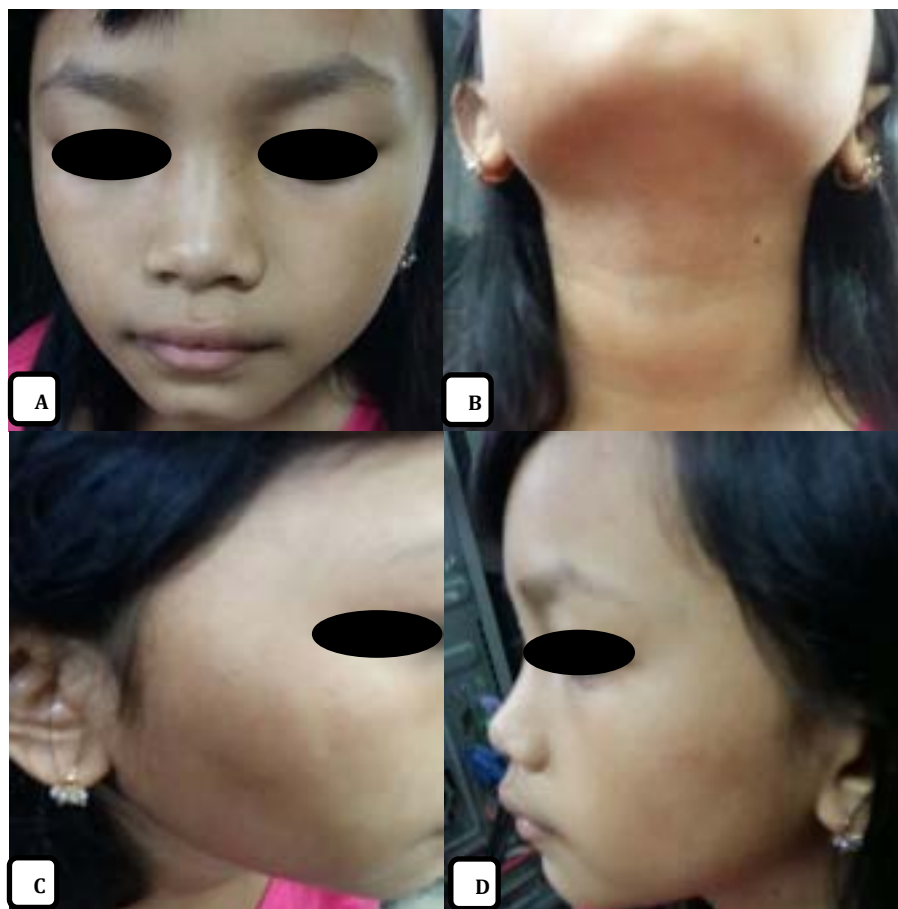
Figure 5. After Treatment: (A,B,C, and D): Good progress of the lesion 4 weeks after treatment, there were post inflammatory hypopigmented macule (KOH examination was negative)