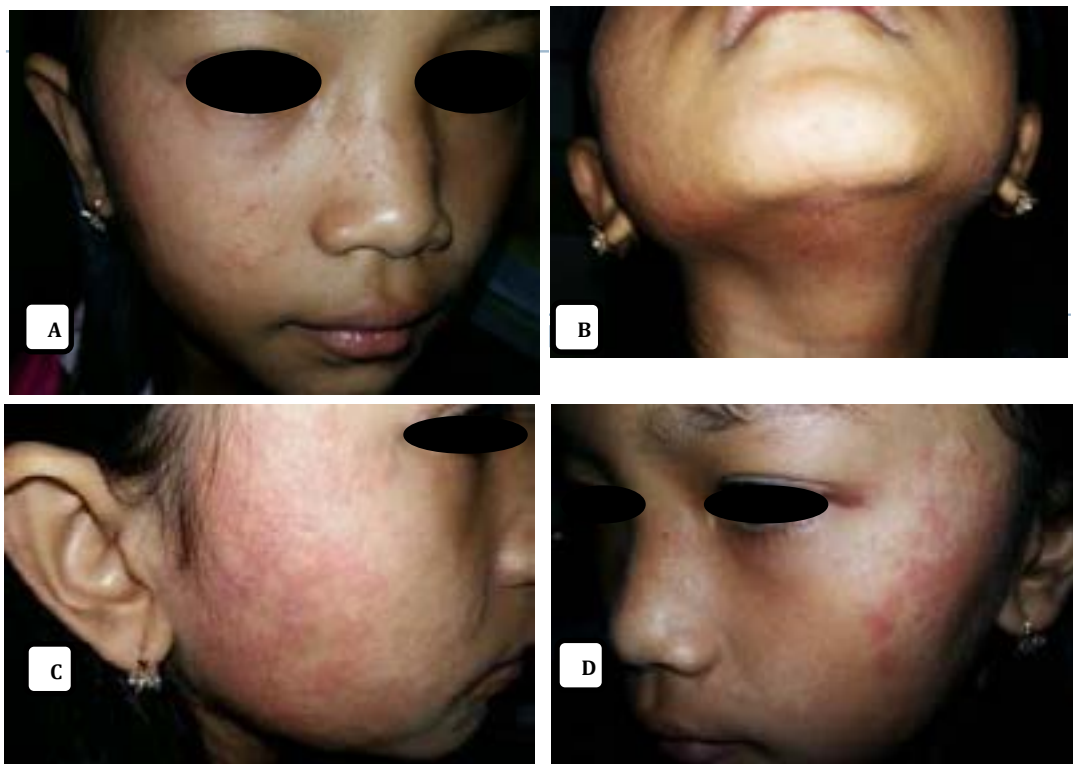
Figure 1. Before treatment: picture A, B on regio facialis and neck: there were erythematous macule, unsharply margined with multiple papule, covered by thin scale. Picture C, D on cheek area: there were erythematous macule/ plaque and multiple papule, covered by thin scale. Clinically, these lesions have a less raised margin and are less scaly than common dermatophytosis.

Physical examination revealed lesions on regio facialis and neck. The lesions were ill defined papular scaly erythematous patches. There were no erosion, pustule, and nor crust.