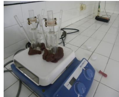
Figure 4. Transport test using Franz Like Difussion Cell

After the mouse skin was ready, the next step was preparing donor and recipient solution for permeation test. Three test tubes were prepared and then the recipient compartment filled with 20 ml of PBS, mounted with mouse skin used a special clamp to the side of the outer skin (stratum corneum) faced the donor compartment (Figure 4).