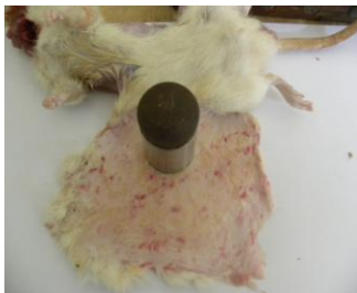
Figure 2. Mouse skin preparation

Ethical clearance was prepared before data collection as involved animal. The permission from Ethic Committee Faculty of Dentistry Gajah Mada University. Three white mice were prepared, then euthanasia was performed and the skin hair were removed with electric shaver and cut with mal punch (Figure 2 dan 3).