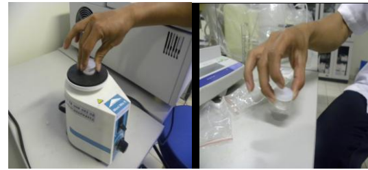
Figure 3. Donor solution preparation

After the mouse skin was ready, the next step was preparing donor and recipient solution for permeation test. Three test tubes were prepared and then the recipient compartment filled with 20 ml of PBS, mounted with mouse skin used a special clamp to the side of the outer skin (stratum corneum) faced the donor compartment (Figure 4).