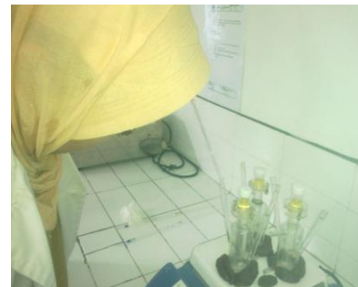
Figure 5. Sample taken from neck cell

The next step took 5 ml of sample after interval time of 4, 20, 24 hours from the neck cell (recipient compartment) using a special pipette volume. Subsequently filled again with PBS solution from the opposite side of the compartment using a pipette volume. Sample placed in a sealed plastic container and then stored until ready for fluoride concentration analysis to BATAN (Figure 5).