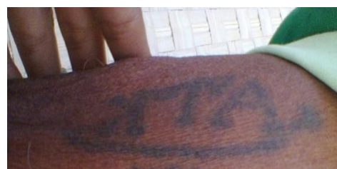
Figure 1 Lunat Kanaf on right arm Photo of Mr. Agustinus Kabnani