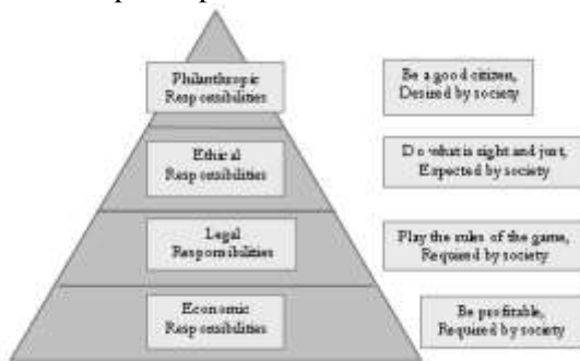
Figure 1. The Pyramid of CSR

proposed by Archie Carroll (1979) (Crane, Andrew and Matten, Dirk. 2007: 25-30). Carroll regards CSR as "a multi-layered concept", which can be differentiated into four inter-related aspects – economic, legal, ethical, and philanthropic responsibilities.