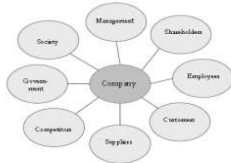
Figure 2. A company's stakeholders

definition of stakeholders aims at any identifiable group or individual who can affect or is affected by the company's operations direct or indirectly, accordingly covering all different parties or groups which mentioned above. The stakeholders of related to an organisation are illustrated in this figure.