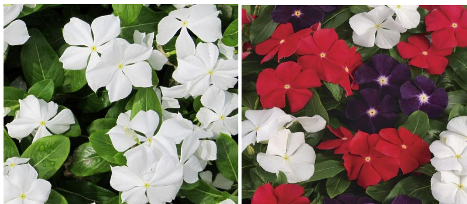
Figure 1. The variety of C. roseus flowers.

C. roseus has long been cultivated for herbal medicine and also as an ornamental plant. In Indian and Chinese traditional medicine, the extracts have been used against numerous diseases such as malaria, diabetes and Hodgkin's disease. It has been reported that C. roseus contain more than 70 different types of chemical constituents such as indole type of alkaloids, ajmalicine, serpentine and reserpine (Kabesh et al. , 2015). The Catharanthus alkaloids provide protection against microbial infection, abiotic environmental stresses such as UV irradiation and are wide importance in clinical medicine due to the anti-hypertensive and antispasmodic properties (Sain and Sharma, 2013; Nejat et al. , 2015).