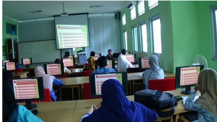
Figure 1. The use of macros program-based evaluation tool

Teaching by development of macros program-based evaluation tool is effective. It can be seen from (1) the student learning result is over KKM, (2) The student independency affects learning result positively, (3) the student learning result by using macros program-based cognitive evaluation model is better than the study of students grade control. Based on the results above, the development of macros program-based cognitive evaluation model that have been tested have met quality standards according to Akker [1].