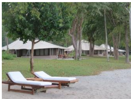
Figure 3. Semi permanent tented camps at Amanwana Resort

Amanwana Resort is characterised by a small number of rooms (only 21 units). It is designed to create the impression that guests are staying in a private residence. The primary focus is on providing a quality experience in a natural setting. Vegetation surrounding each tent was left intact (Figure 3), suggesting a minimum alteration of the local surroundings.