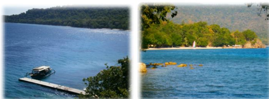
Figure 1 Natural setting of Amanwana Resort overlooking the Marine Nature Tourism Park

water body is legally protected as a Marine Nature Tourism Park and a Hunting Park. Amanwana Resort is located in the buffer area and adjacent to the Marine Tourism Park (Figure 1). Amanwana operates under the management of Aman Resort.