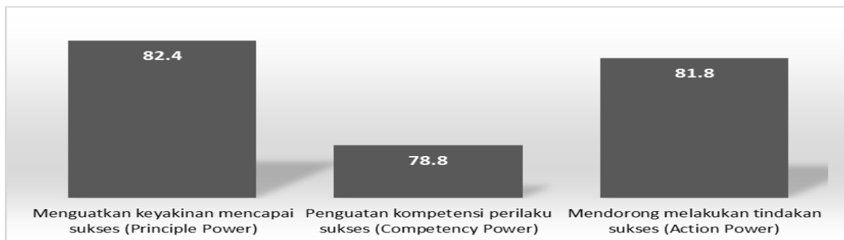
Figure 2. Percentage of HRD Training Program Influence towards the Achievement of Training Objectives in the Structure of Pumping HR model

This program has provided a great influence on the three important objectives of the pumping HR model-based HRD training program, namely: (1) the conviction of the participants to achieve success (pumping principle) through their current profession or position, (2) the strengthening of competencies to achieve success (pumping competency) through professional behaviour that is in accordance with working culture in IPB, and (3) the urge to perform successful actions (pumping action) in working and everyday social relations. Based on the results of the questionnaire of the training program influences the three important objectives mentioned above is as shown in Figure 2 below.