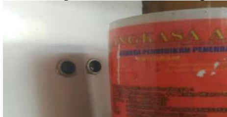
Figure 6. Ultrasonic sensor detects glass

The testing of a glass reader ultrasonic sensor is done by bringing the glass object closer to sensor. If there is an object in front of the ultrasonic sensor it will be read and forwarded to pins 4 and 5 so that it can be processed into Arduino and released through pin 11 which is worth 1 so that the transistor works and the relay gets positive and negative voltage so that the water pump can light up for a certain period. The ultrasonic sensor detects the glass as shown in figure 6. as follows: