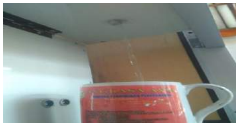
Figure 9. Open selenoid valve