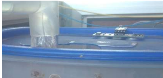
Figure 5. The sensor reads the water level limit

Citation: Azzari Aldaf , H., Hartami Santi , I., & Primasari, Y. (2019). DESIGN OF TANDON AND AUTOMATIC FILLING TOOLS ON DISPENSERS WITH ULTRASONIC SENSORS. JARES (Journal of Academic Research and Sciences) , 4(1), 55-64. https://doi.org/10.30957/jares.v4i1.690