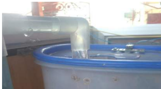
Figure 4. The process of filling water into the tendon