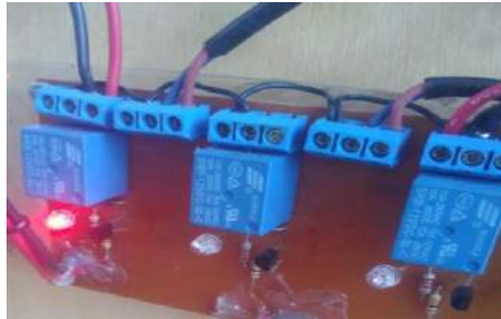
Figure 7. Relays function properly

Citation: Azzari Aldaf , H., Hartami Santi , I., & Primasari, Y. (2019). DESIGN OF TANDON AND AUTOMATIC FILLING TOOLS ON DISPENSERS WITH ULTRASONIC SENSORS. JARES (Journal of Academic Research and Sciences) , 4(1), 55-64. https://doi.org/10.30957/jares.v4i1.690