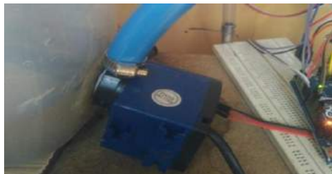
Figure 8. water pump

The pump output of pin 11 is 1 then base TR1 gets a positive voltage, the transistor will work, the relay gets 2 voltages so that the position of the relay switch changes and will turn on, so the pump and selenoid are on. Testing selenoid by turning on all devices, after that the ultrasonic sensor detects the maximum limit of water on the reservoir, when it is full of water it will stop filling the reservoir. The ultrasonic sensor on the dispenser will detect whether or not there is a glass, after that it will be sent to the microcontroller and the microcontroller will order the relay and proceed to the pump and selenoid valve. Pumps and selenoids here work together because they are arranged in parallel.