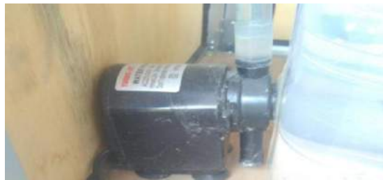
Figure 3. pumping gallon water into the reservoir

Testing the water pump is done by giving a voltage of 5v. If the output pin 10 on Arduino is worth 1 then it is forwarded to the base of transistor 3 and gets a positive voltage so that the transistor works, the relay also gets a positive voltage so the water pump can turn on.