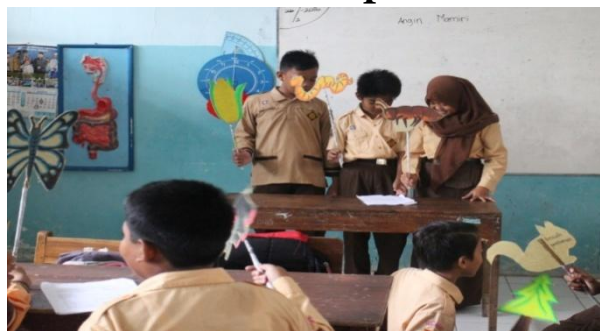
Figure 2 Students When Showing Results of Creative Drama Manuscripts

The following are some pictures of the learning process of the students' final test (posttest) stage when writing a creative drama based on conservation values: