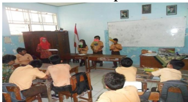
Figure 3 Students When Showing Results of Creative Drama Manuscripts