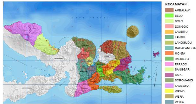
Figure 1. Bima Regency Administration Map

Regency, West Nusa Tenggara Province, the location was very strategic in looking at case studies and problems that occur. The following picture is a map of the research location;