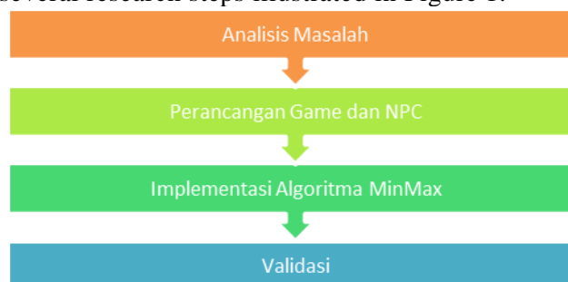
Figure 1. Research Steps

This study has several research steps illustrated in Figure 1.