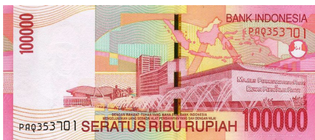
Figure 3 Banknotes using Braille Design

From the results of the first experiment, 40 respondents (80%) were not able to identify the nominal values of the banknotes with the